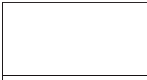
Acrylic Shelves (3)